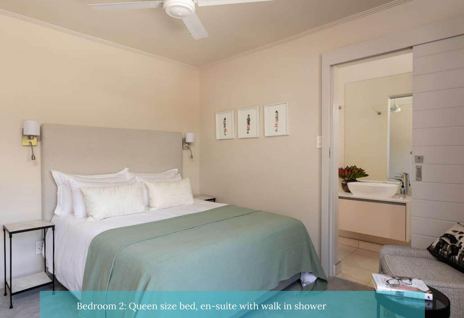
Bedroom 2: Queen size bed, en-suite with walk in shower