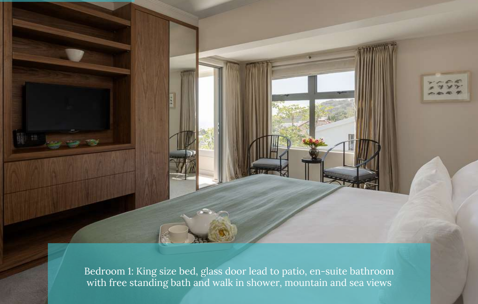
Bedroom 1: King size bed, glass door lead to patio, en-suite bathroom with free standing bath and walk in shower, mountain and sea views