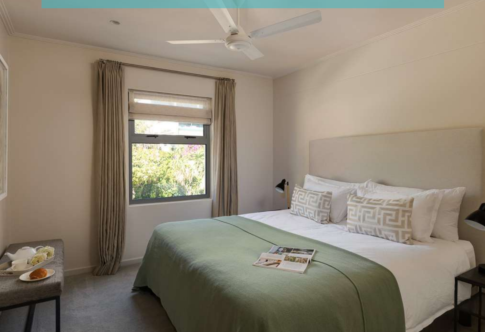
Bedroom 3: King size bed, dedicated bathroom with walk in shower